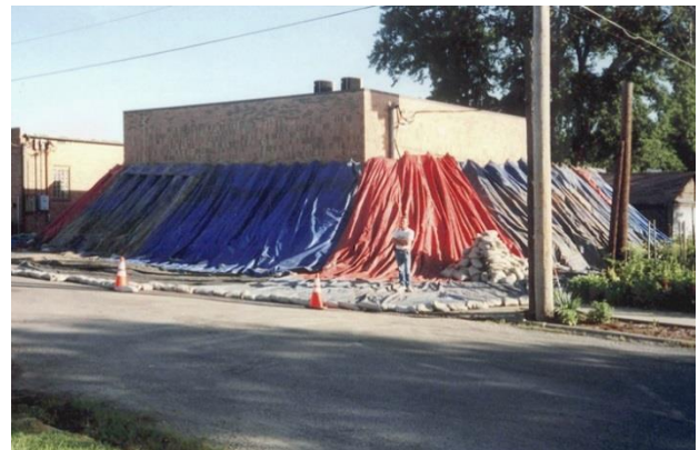
Protecting critical telecommunications infrastructure

Installation. Our certified crews will then install the frames and deploy and secure the fabrics prior to the approach of floodwaters. The system is easy to install and our teams can provide full-deployment of the system or our supervisors can oversee the system setup by others, allowing simultaneous deployment across multiple locations. Depending on conditions, a three-person crew can erect 100s of linear feet per day.