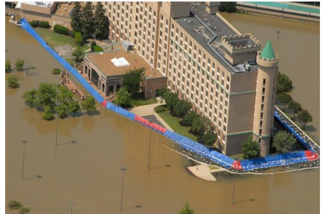
Protecting property from the Mississippi River floodwaters

The system is currently available in heights of 5' and 7' and individual units can be quickly combined to accommodate varying elevations and required configurations and contours.