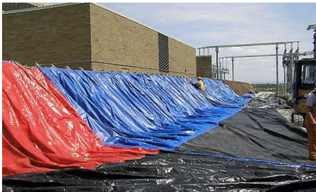
Protecting the power grid from flood damage

After the U.S. Army Corps of Engineers finished testing the Portadam product, they also purchased 8,000 linear feet of 5-foot high units for flood control. They had sections then stationed across the country for rapid deployment to emergency sites.