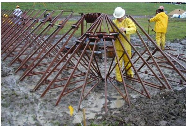
Simple system setup and removal

Transportation. The system (frames, fabrics and hardware) is bundled, easily loaded on flatbed trailers and shipped to the location. It can be deployed to all parts of the country in a matter of days.