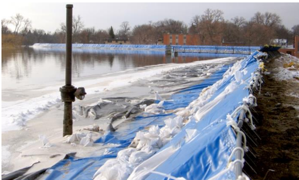
Levee extension in Fargo, North Dakota

Portadam has a history of successfully preventing damage from flood waters. After excelling in USACE's lab and field tests, the Portadam system has been used to divert floodwaters away from key infrastructure such as emergency response centers, treatment plants, power plants/substations, and telecom switching stations.